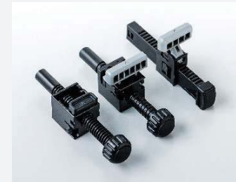
LC Adjuster customized to meet the requests from clients