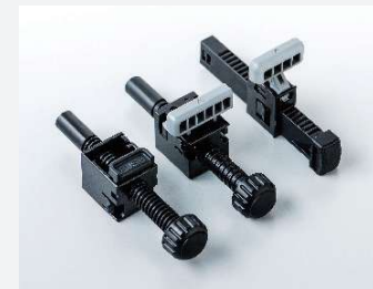
LC Adjuster customized to meet the requests from clients