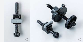
(1) LC Adjuster developed by NIX (2) The metal adjuster (right), which was used at the early stage of development, and the LC Adjuster (left)

We not only meet the needs of clients, but also pursue ideals and new values when manufacturing products.