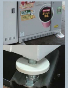
[ Example of installation ] Our products have been installed in automatic vending machines at station platforms, etc., including the fully automatic vending machines set at the venue of Expo 2005 in Aichi Prefecture.

With the keywords: safety, repellent action, and long-lasting property, we handle a wide variety of products, including injection-molded items.