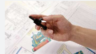
We repeat trial production to embody ideal shapes, for example, by conducting durability experiments many times.